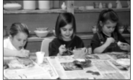
Local children participating in arts and crafts.

Summer is a great time to explore individual creativity by participating in arts and crafts classes. Afternoon Art for Young Children is a series of art activities especially designed for younger children. The Children's Visual Art Workshops will be held at the Jan Dempsey Community Arts Center and will include classes conducted by area artists and art educators. Clay sculpting, ceramics, and decorating classes are also available.