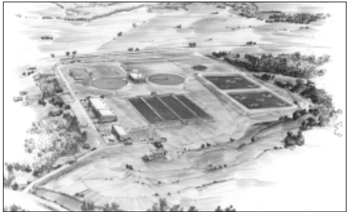
H.C. Morgan Wastewater Treatment Plant

One of the City's goals for this year is to arrange financing for the construction of the expansion of the Northside Wastewater Treatment Plant and for the installation of a major sewer line on the southwest part of Auburn. As part of the plan to arrange how to pay for these improvements, the City Council asked that it be done without raising sewer rates. On May 15, the Council approved a plan to raise the $10 million needed for the improvements without raising sewer rates.