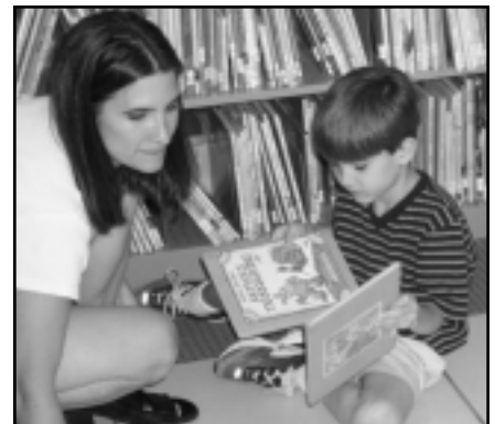
A young boy picks out a book from the Library.

With a new facility, a larger staff, and exciting new programs, the Auburn Public Library offers more reasons than ever to visit. For information on these programs and when they will be offered, call 887-4997. If you haven't yet been able to visit the new Library, we hope you will soon be able to stop by the new Public Library at the corner of Dean Road and Thach Avenue.