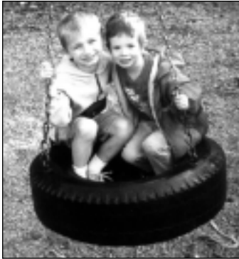
Two of Auburn's youth enjoying Summer Day Camp.

Swimming classes are offered throughout the summer at Samford Pool for beginners and advanced swimmers. Other aquatic activities such as scuba, water polo, snorkeling, diving, lifeguard training, and water