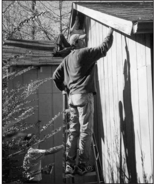
Volunteers can assist those in need through the Helping Hands program.

The public should expect STOP AHEAD signs to be posted a few weeks in advance of the installation of the four-way stop and the presence of Police at the intersection. For further information, please contact the Public Works Department at 501-3000.