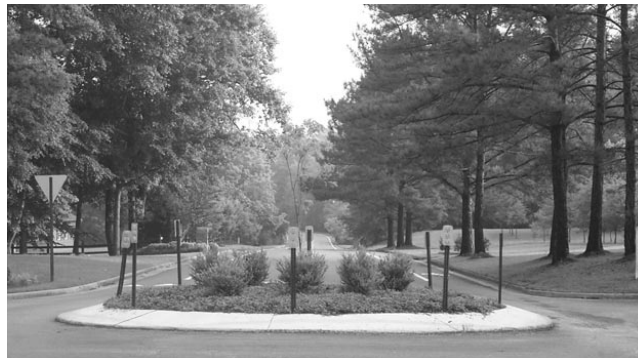
The traffic calming circle at the intersection of Windway Road and Kentwood Drive has slowed traffic in that neighborhood.

In November 2002, the City Council approved the Neighborhood Traffic Calming Policy to aid citizens in resolving traffic problems in residential areas by encouraging citizen involvement in neighborhood traffic management activities.