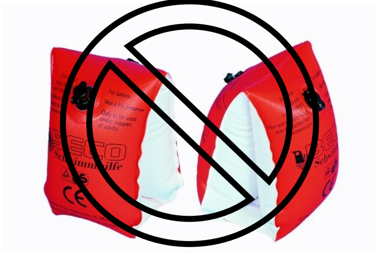
Water Wings/Arm Floaties