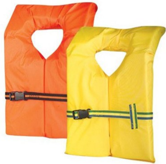
Basic Life Vest