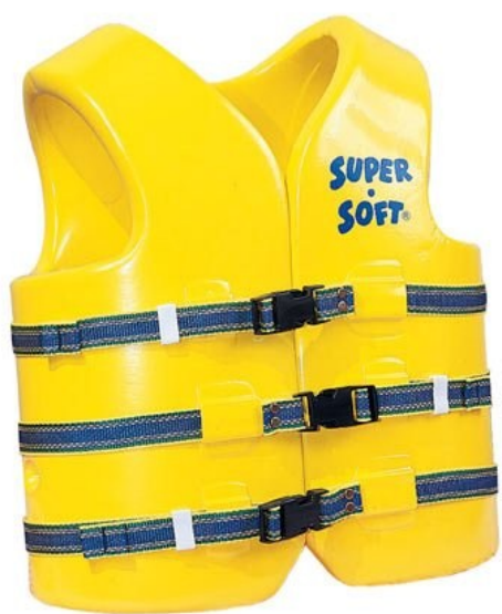
Children's Life Vest