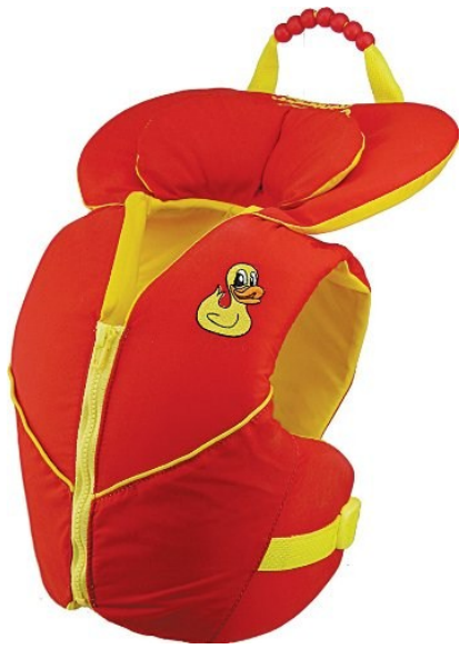
Infant Life Vest