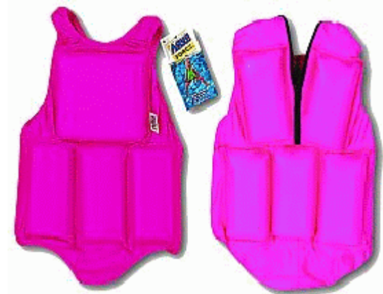
Flotation Swim Suits