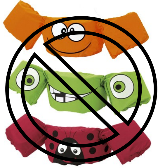
Water Wings with Belts