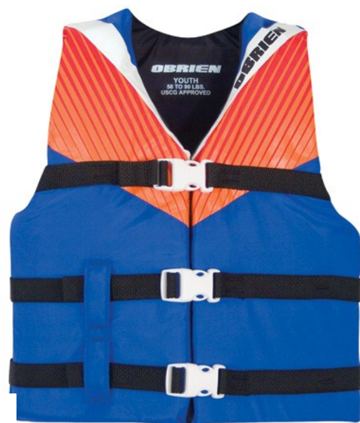
Standard Life Vest