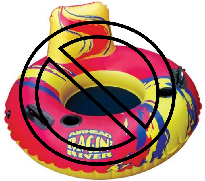
Inner Tubes with Seats